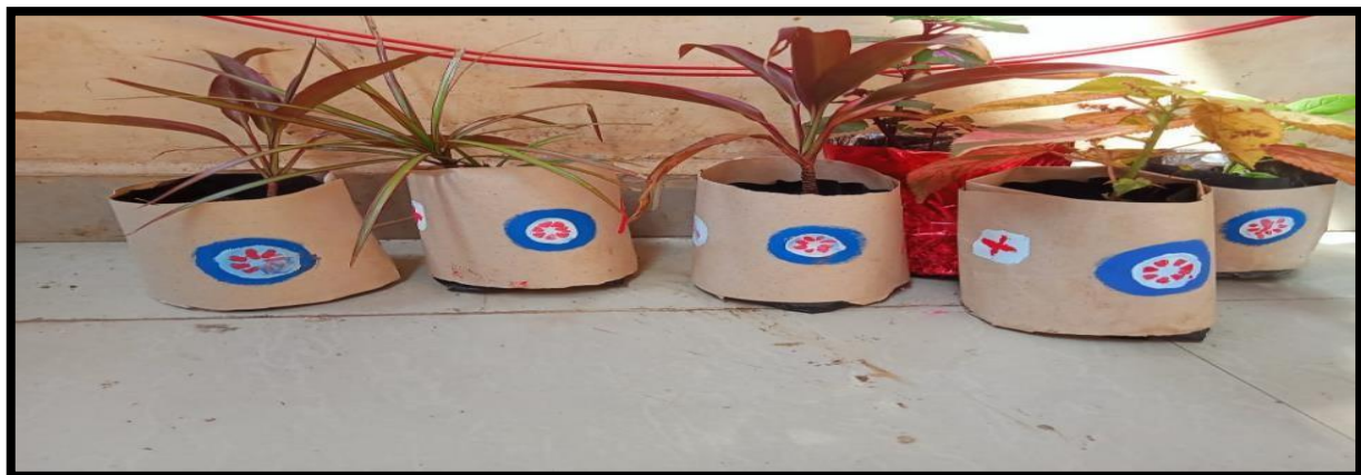
Plants saplings for honoring the guest in valedictory session